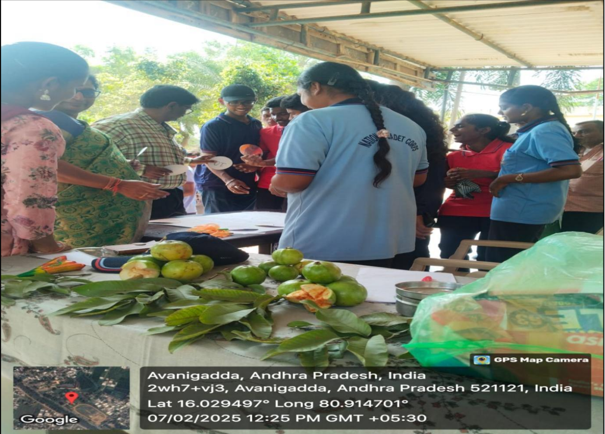
STALL BY NCC STUDENTS