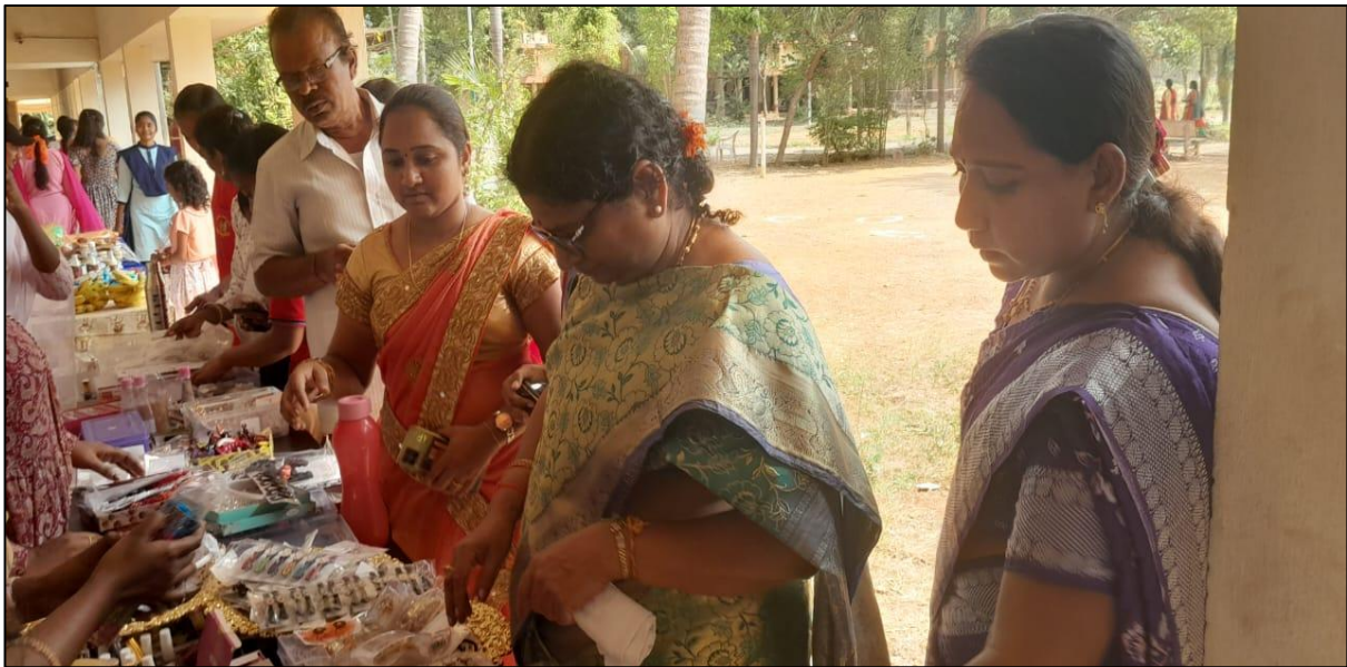
STALL BY PG STUDENTS