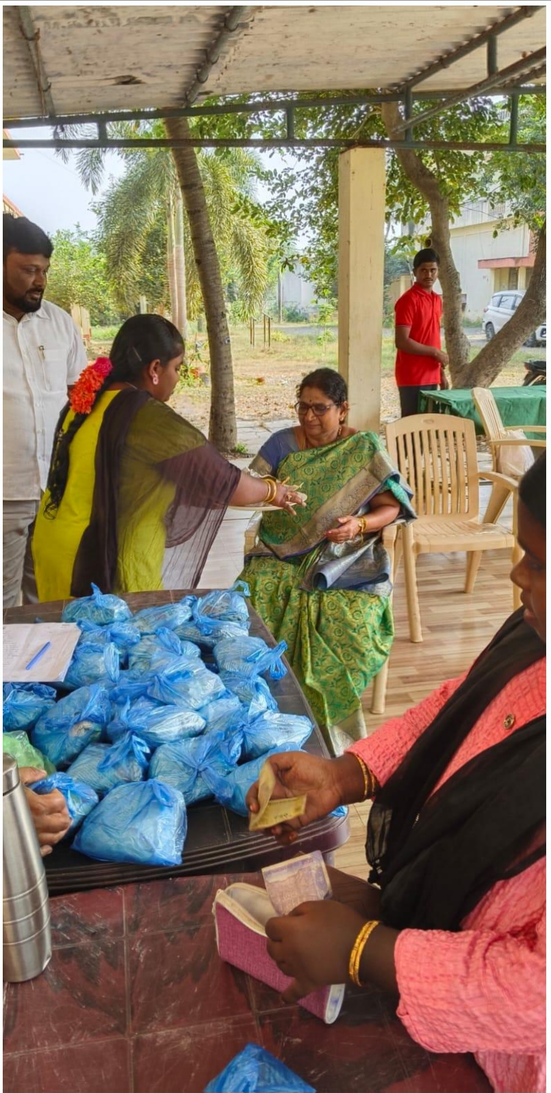
DEPARTMENT OF ARTS