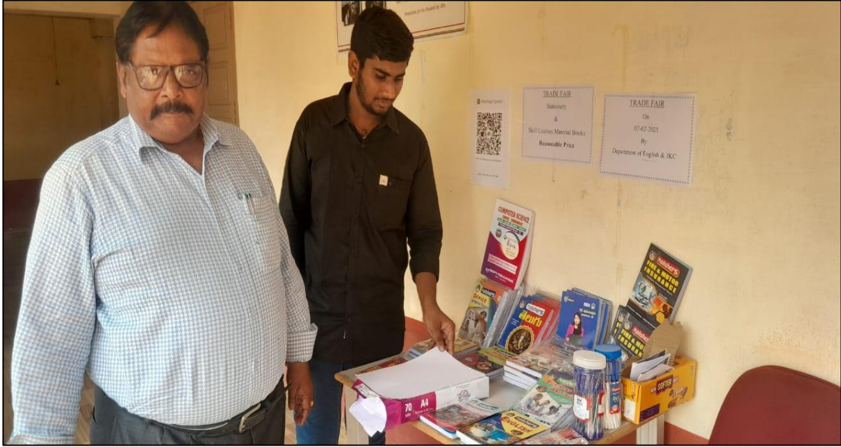
DEPARTMENT OF ENGLISH