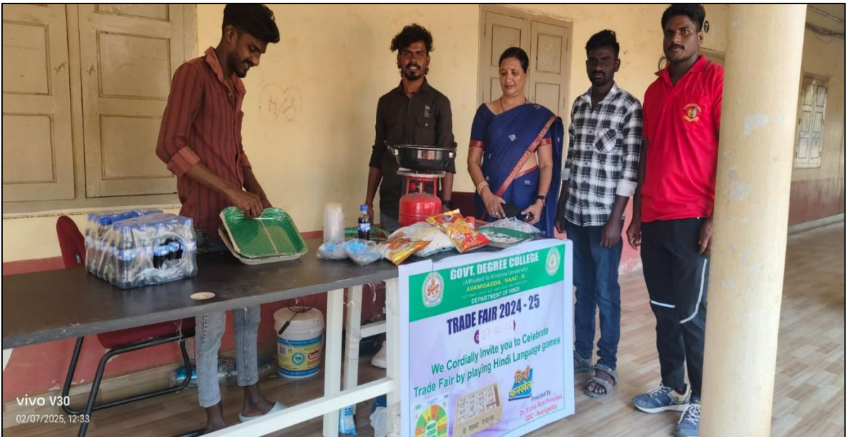
DEPARTMENT OF HINDI