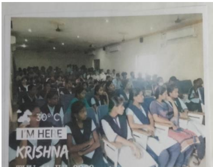
students participated in the programme.