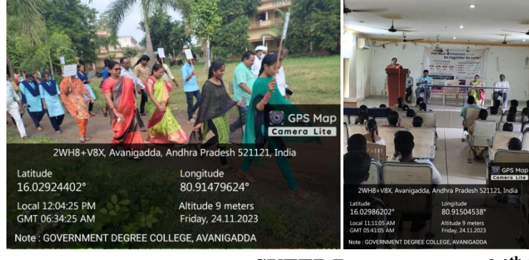
An awareness programme on SVEEP Programme on 24th Nov.

Nss volunteries staff and students service at Moopidevi sri subramaneswara swami temple, at mopidevi