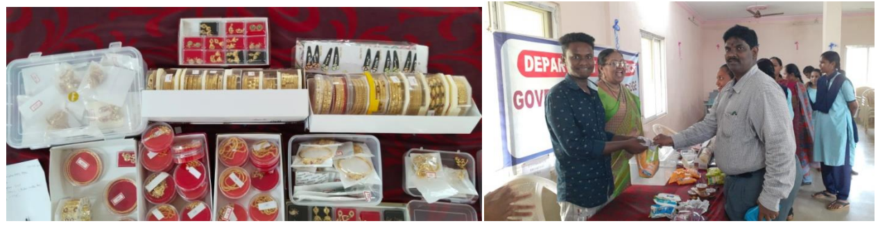
Dept. of Commerce organizing "COMMERCE MEN EXPO"