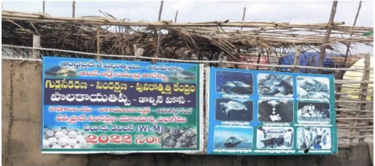
Hatchery center of Olive Ridle TORTTELS