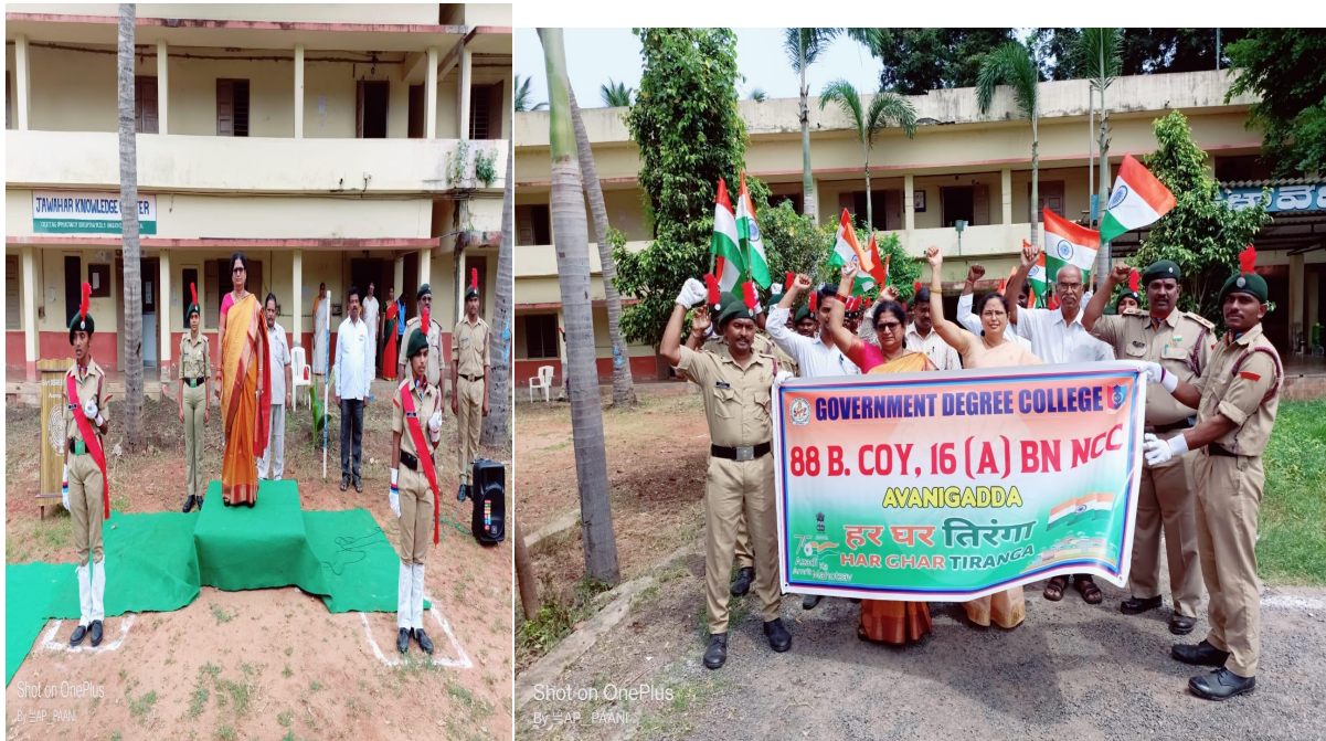
INDEPENDENCE DAY CELEBRATIONS- NCC CADETS RALLY WITH FLAGS

Celebrating 75 Years of Independence - The Government of India has taken up 'Azadi Ka Amruth Mahotsav'. The college has taken up a series of activities as a part of celebration. Some of the activities are shown here... The activities continued upto 15-Aug-2022