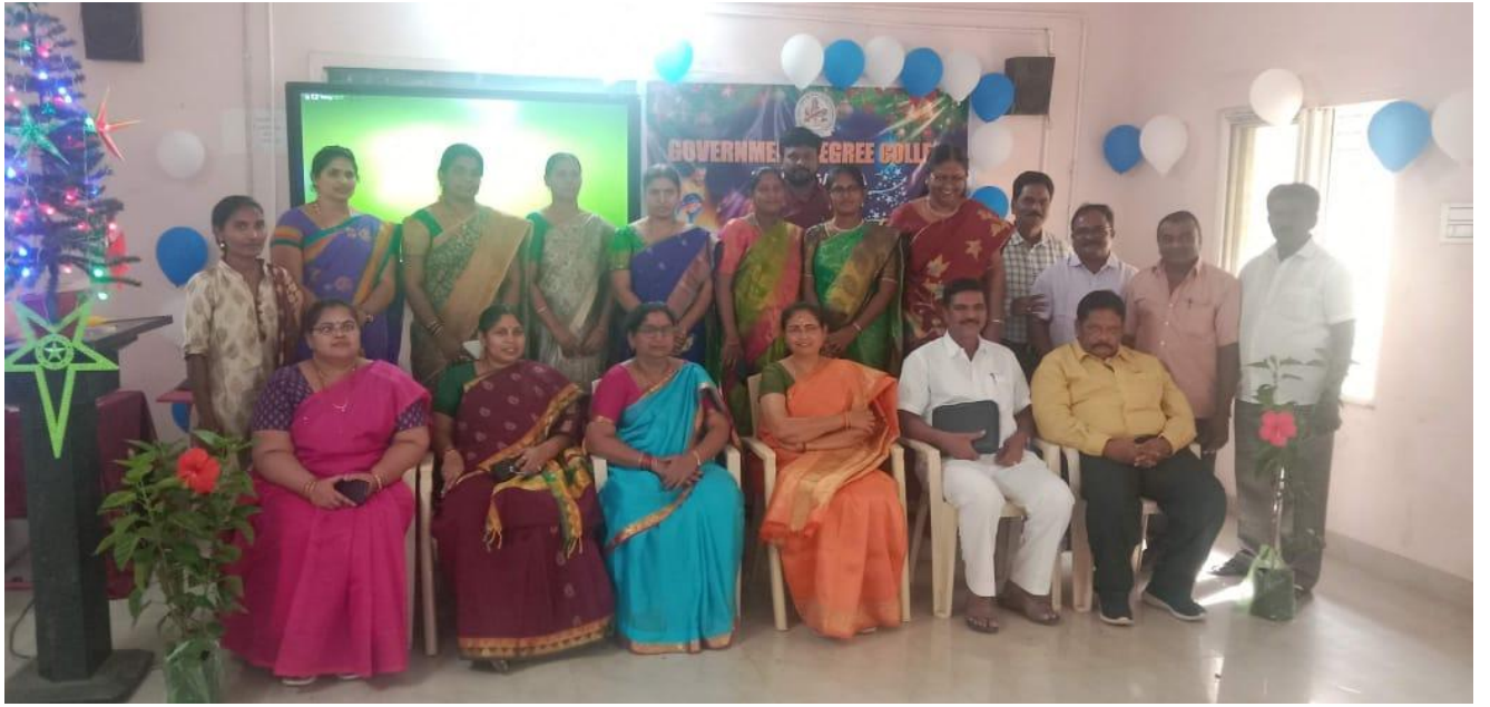
CELEBRATING THE DIVERSITY IN CULTURE