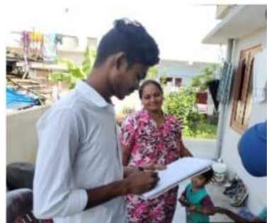
Paving way to better citizenship