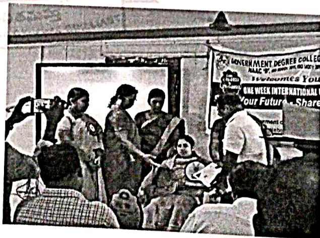
Felicitate the guest