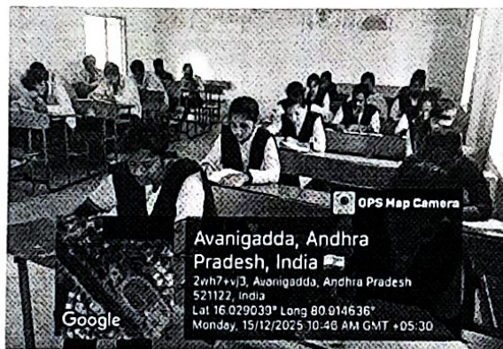
Students Essay writing