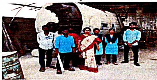
Central boiling unit