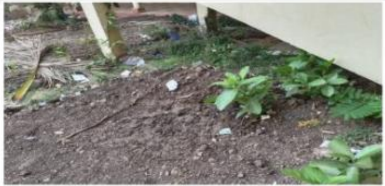
Rain water harvesting